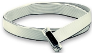
CA-90, Ribbon cable with male DB15 connector for DAC488HR digital I/O, 6 ft.