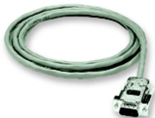
CA-89, Shielded cable with male DB9 connectors for DAC488HR analog output, 6 ft.