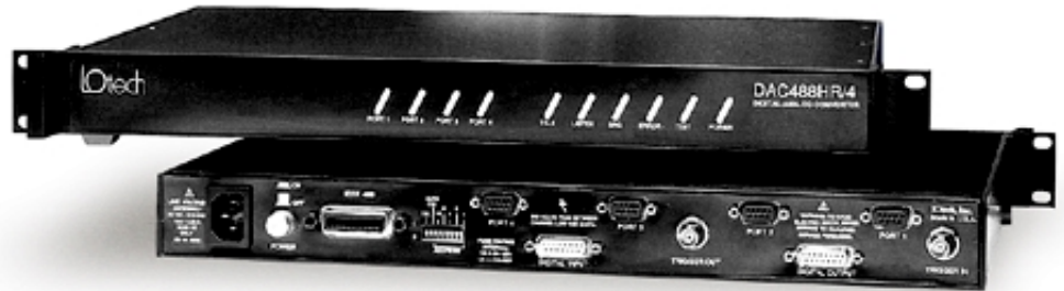
The versatile DAC488HR functions as a voltage source, function generator, and an arbitrary waveform generator

Waveforms captured by IOtech's 16-bit, 100-kHz ADC488A series (see p. 243) digitizers can be edited and transferred to the DAC488HR for output. The ADC488A™ series and DAC488HR in combination form a powerful waveform I/O system. Typical applications include transducer simulation, disk drive testing, vibration analysis, and materials testing.