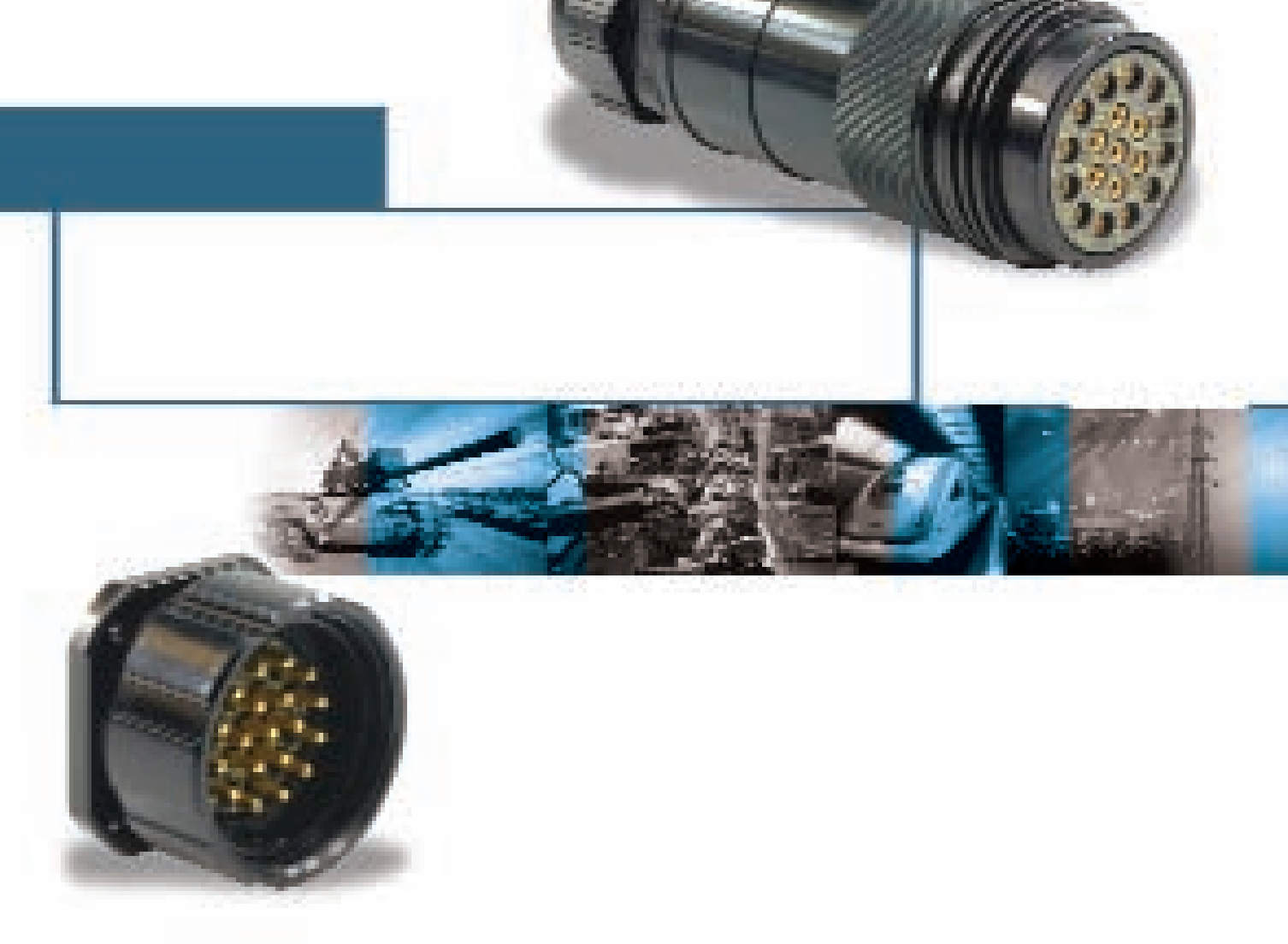
Engineered for life

19 Pin Connectors for Lighting Applications