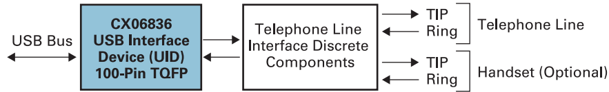
CX06836 Modem Simplified Interface Diagram