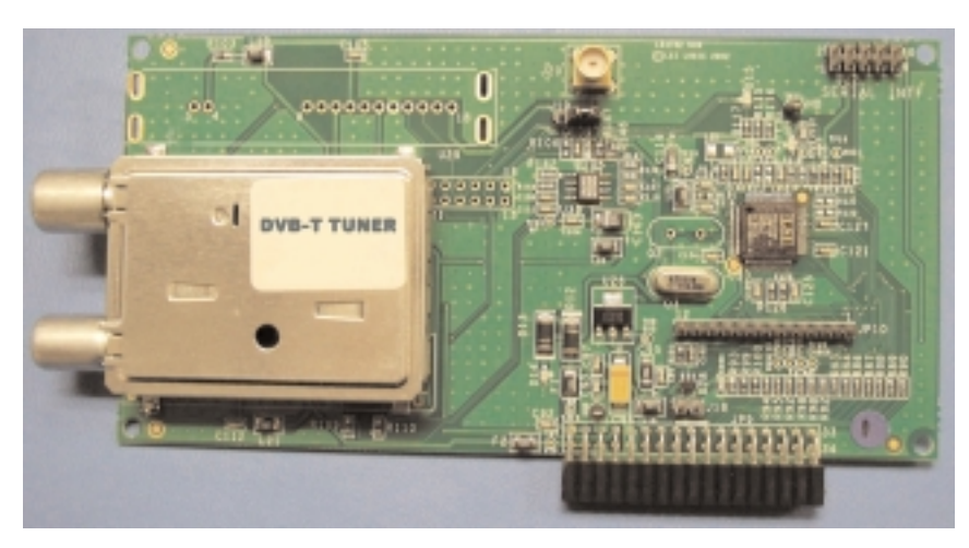
The NIM782 Evaluation Board provides full capabilities for accelerated development and fast time-to-market