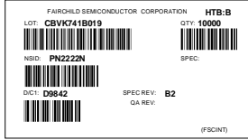
F63TNR Label sample