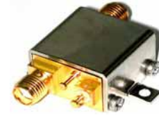
CASE STYLE: GC957