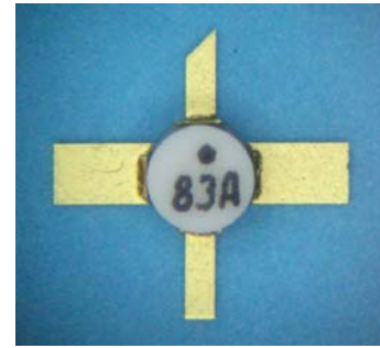
GATE LEAD IS ANGLED