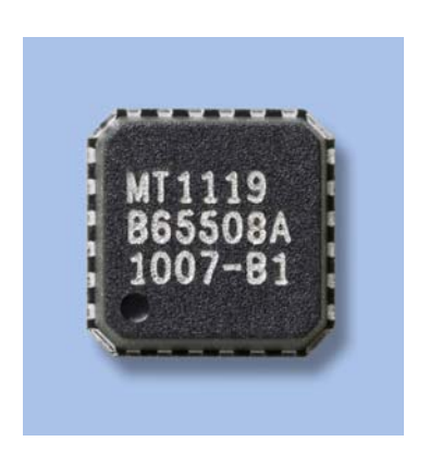
MT1119 High Performance Automotive AM/FM Amplifier Subsystem

The MT1119 is a highly integrated and complete RF amplifier subsystem for active AM/FM antennas