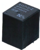
Dust Covered 17.5×15×20