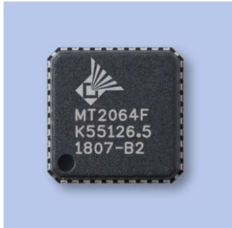
MT2064 Single-Chip Broadband Tuner

The MT2064 is a low-power 3.3V single-chip broadband tuner with an integrated IF variable-gain amplifier.