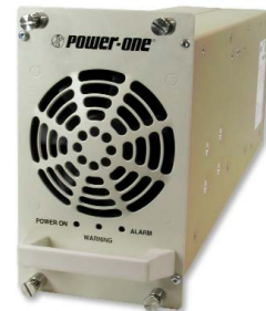
PMP 25 Rectifier