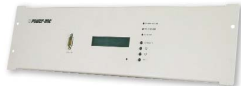
PCS Supervision Module