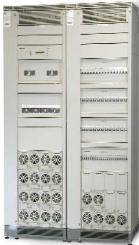
PPS 25 with integrated DC distribution