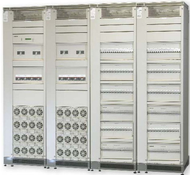
PPS 25 with bulk outputs feeding remote DC distributions