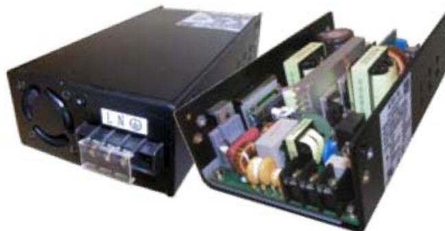
PSRL5016U4 Series: (U-Chassis): 7(L) x 4(W) x 2(H) inches PSRL5016E4 Series: (Enclosed with built-in fan): 8(L) x 4(W) x 2(H) inches