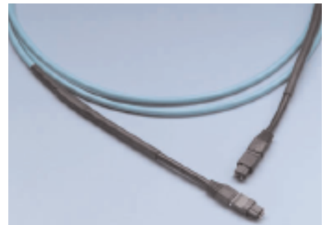
MTP to MTP Round Ribbon Cable Assembly