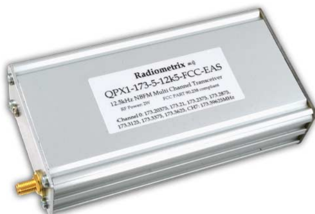
Figure 1: QPX1-173-5-12k5-FCC-EAS

The QPX1 transceiver module offers a 2 watt RF output VHF radio link, in a robust aluminium extruded casing. This unit is ideally suited to applications where existing lower powered transceivers provide insufficient range. The QPX1 is a multi-channel, narrowband design, suitable for licensed and unlicensed VHF allocations, FCC part 90 operation, and the 2M amateur band.