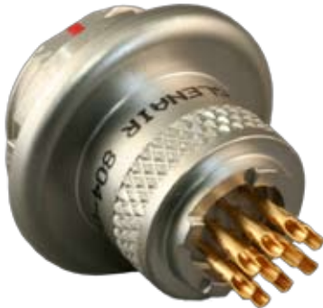
Series 804 Hermetic Jam Nut Mount

Series 804 Hermetic Receptacles feature 304L stainless steel shells, fused vitreous glass insulators and gold-plated Alloy 52 iron alloy contacts.