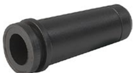
HN 14.45 PVC Strain Relief