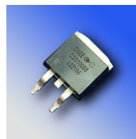
Fig. 3 D 2 PAK