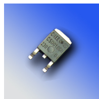
Fig. 2 DPAK