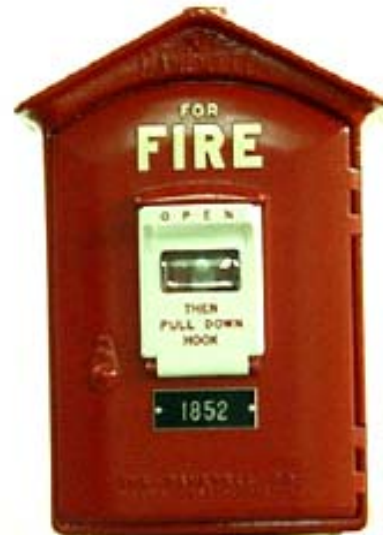
Three-Fold Fire Alarm Box