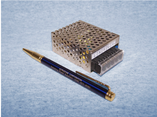
2.59"W x 1.98"L x 1.1"H