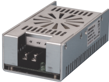
2.5"W x 4.75"L x 1.5"H