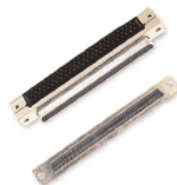
PCB Mounting Connectors