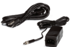
12 VDC Power Supply