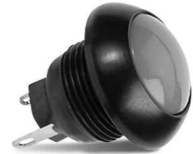
Flush Dome Button