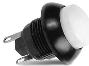
Raised Dome Button