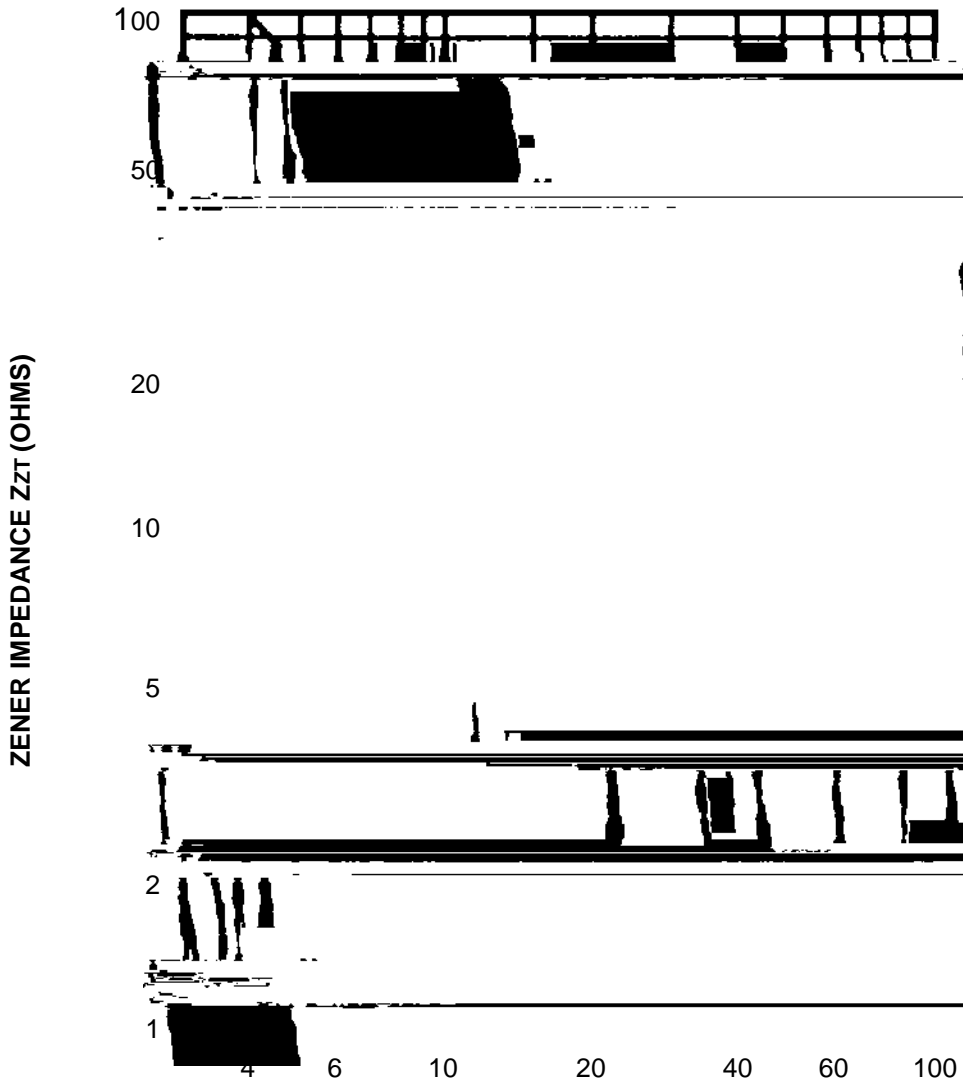
FIGURE 3 operating current (mA)