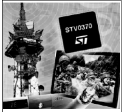
Figure 1. STV0370 optimized front-end IC for US digital TV