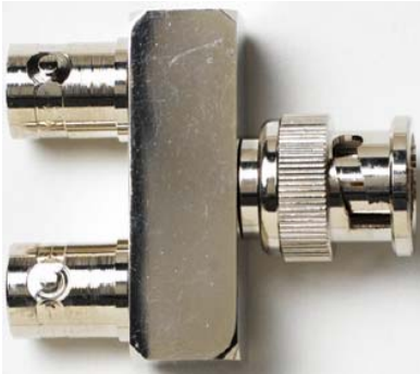
Model 6754 BNC (F/M/F) Adapter, In-Line 75 Ω