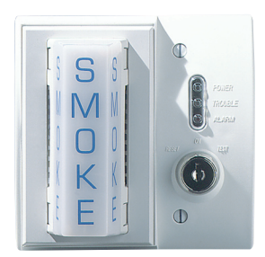
SSK451 with PS24LOW strobe and PS12/24 LENSW lens