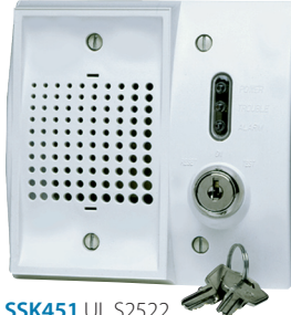
SSK451 UL S2522