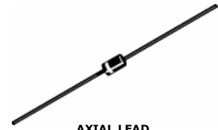
AXIAL LEAD DO35