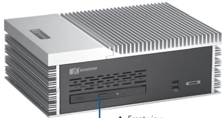
▲ Front view Optional DVD version

Fanless Embedded System Featuring Socket M Intel® Core™2 Duo Processor up to 1.5 GHz and PCI Slot