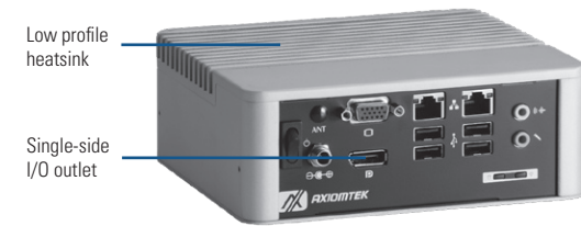
▲ Front view

Fanless Embedded System with AMD G-Series APU T40E 1.0 GHz and VGA & DisplayPort for Dual Display