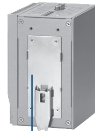
Din-rail kit ▲ Rear view