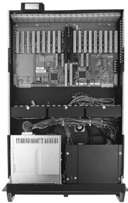
▲ Top view