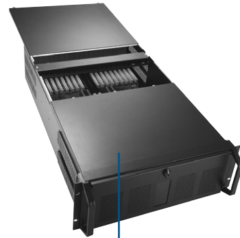
Dual top cover design for easy maintenance