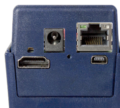
Argos 2D - A100 connector view