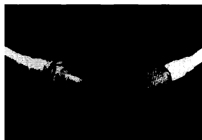
Figure 2. Threaded triaxial connectors