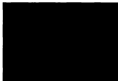
Figure 4. Splice kit