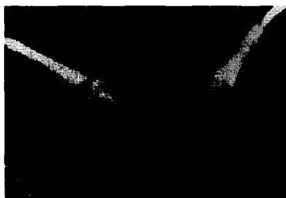
Figure 3. Bayonet triaxial connectors