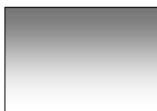
(a)64 Gray Pattern