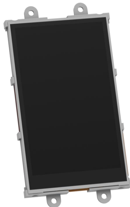
The uLCD-32W-PTU Display Module