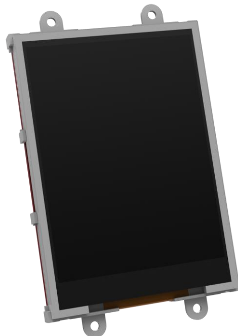
The uLCD-32-PTU Display Module