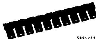
Strip of 10