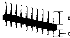
Single Row Header