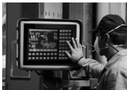
▲ Ideal for factory automation & self-service kiosk in retail