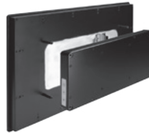
▲ Modulated design