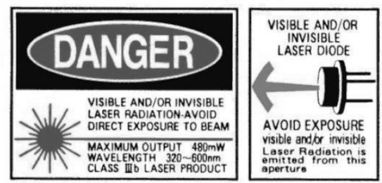
This product is comply with 21 CFR Part 1040.10

This laser diode emits highly concentrated blue light which can be hazardous to the human eye and skin. This diode is classified as CLASS 4 laser product according to IEC 60825-1 and 21 CFR Part 1040.10 Safety Standards.