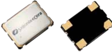
7.0 x 5.0mm Ceramic SMD