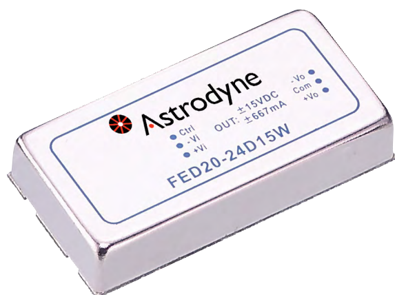
Unit measures 1"W x 2"L x 0.4"H