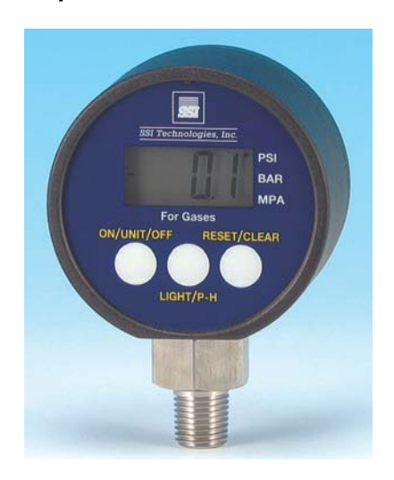
MediaGauge™ Model MGA-9V with rubber boot option