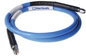
CASE STYLE: MA1628-1.5