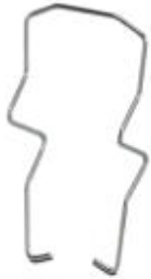
Relay retaining bracket, wire model, suitable for RIF-1 relay base, for 25 mm high octal miniature power relays

Please be informed that the data shown in this PDF Document is generated from our Online Catalog. Please find the complete data in the user's documentation. Our General Terms of Use for Downloads are valid ( http://phoenixcontact.com/download )