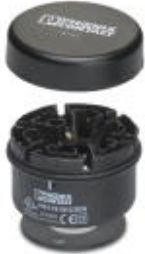
Connection element with screw connection terminal blocks for base mounting

Please be informed that the data shown in this PDF Document is generated from our Online Catalog. Please find the complete data in the user's documentation. Our General Terms of Use for Downloads are valid ( http://phoenixcontact.com/download )