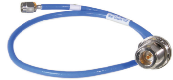
CASE STYLE: KQ1669-XX