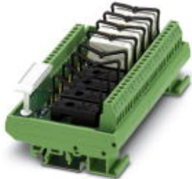
VARIOFACE module, for 8 plug-in miniature relays or miniature optocouplers, with LED, 110 V DC input voltage

Please be informed that the data shown in this PDF Document is generated from our Online Catalog. Please find the complete data in the user's documentation. Our General Terms of Use for Downloads are valid ( http://phoenixcontact.com/download )