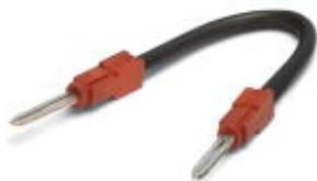
The figure shows the 60 mm version

Wire bridge, length: 110 mm, width: 5.1 mm, number of positions: 1, color: red/black